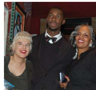
Creating Futures Benefit and Silent Auction