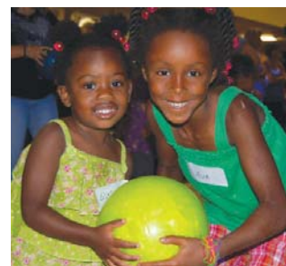
Lanes for Change Bowling Event